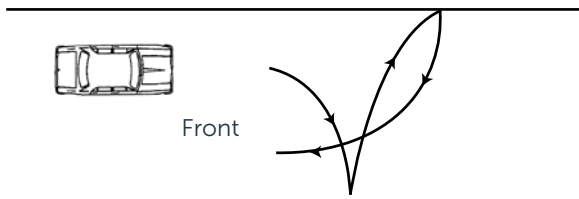
Three point turn

If there is no opportunity to do a reverse parking task, you may be asked to do a three point turn. You must show you can look for potential hazards before and while making the turn and then while reversing the car. You are allowed to use a driveway when making the turn, but you must not drive onto private property. You should not hit or mount the kerb. You need to use your indicators correctly and move off on the correct side of the road.